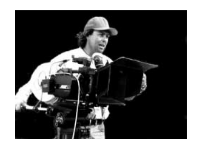
Awards for Peace Out the film: